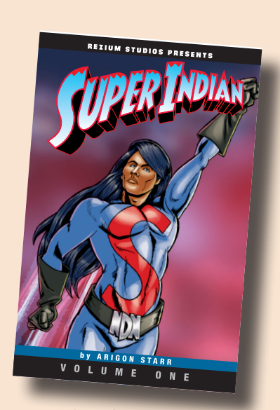
Super Indian Volume One: © 2012 Wacky Productions Unlimited. All Rights Reserved.